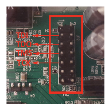
Fig. 4. JTAG interface

munications. Special software is also needed on the connected computer, such as SPIFlash<sup>10</sup>, or flashrom<sup>11</sup>.