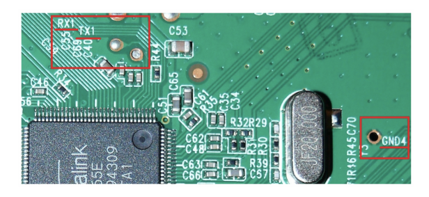
Fig. 1. UART ports on the TP-Link W8951ND router